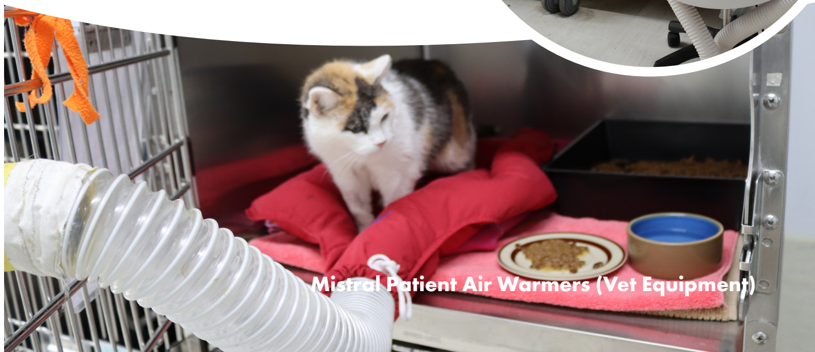
Mistral Patient Air Warmers (Vet Equipment)